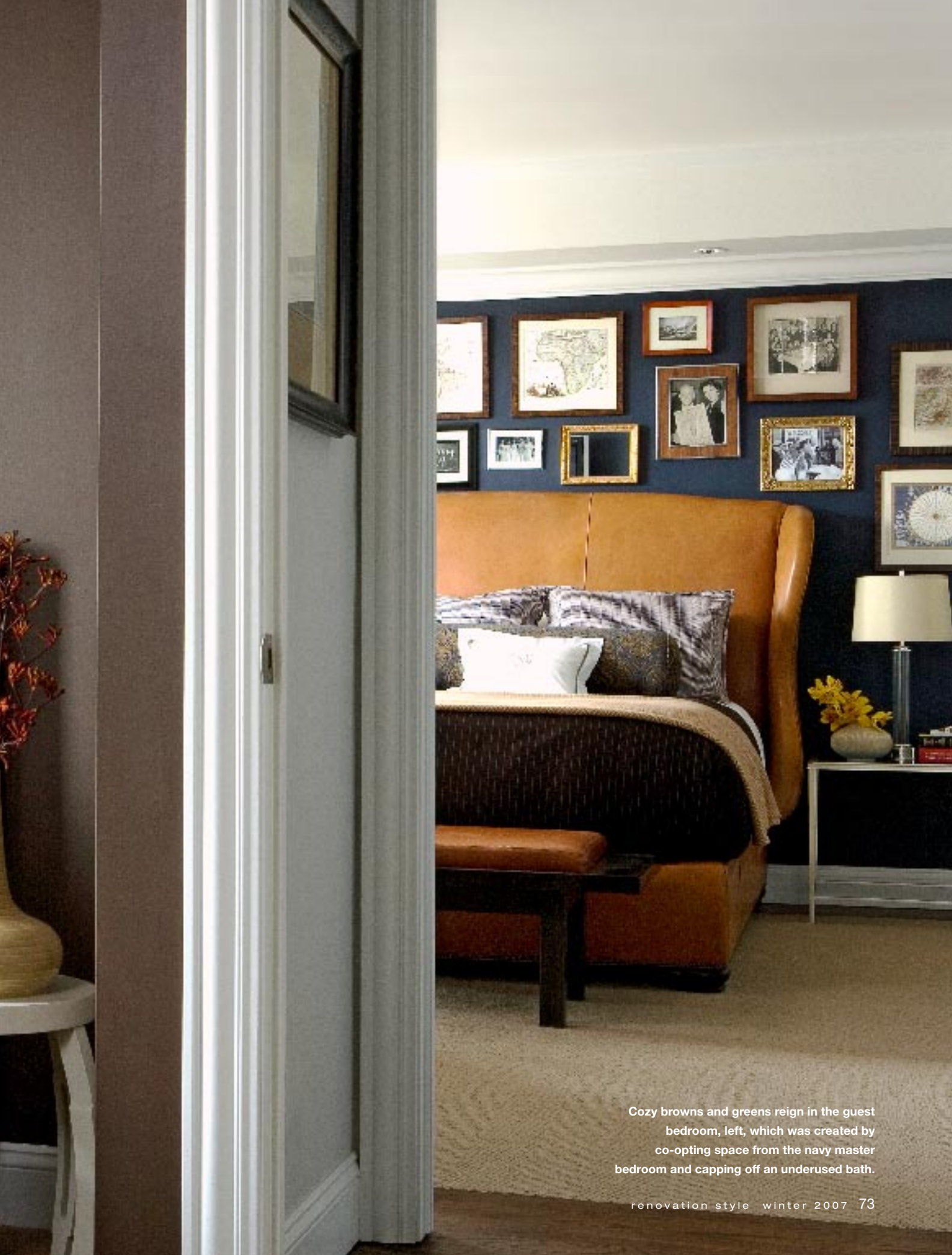
Cozy browns and greens reign in the guest bedroom, left, which was created by co-opting space from the navy master bedroom and capping off an underused bath.